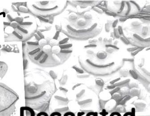
Decorated Marie biscuits