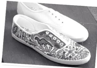
Decorated shoe or boot